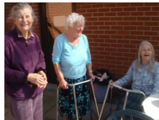
Some of our ladies enjoying a laugh together

These QA forms are sent out twice a year and are used to monitor and improve on our service. So far we have only received 7 back! Look forward to receiving some more!